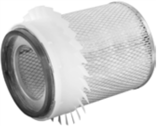
Fresh Air Intake Replacement Filter 78R5210